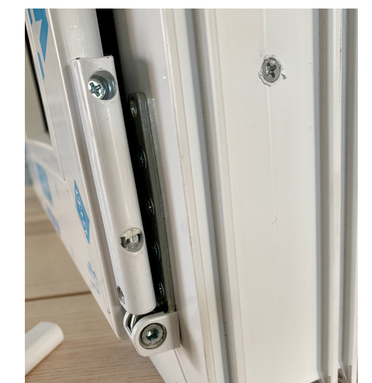
Adjustment screw on bottom: left and right