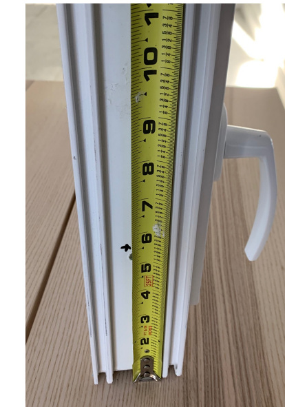
3rd screw: 6" from bottom

Step 4: Seal window (see detailed window installation guide).