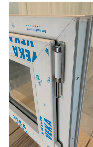
Take out pin from top

Step 2: You can either use a timber frame between window frame and concrete or install the window directly on the concrete.