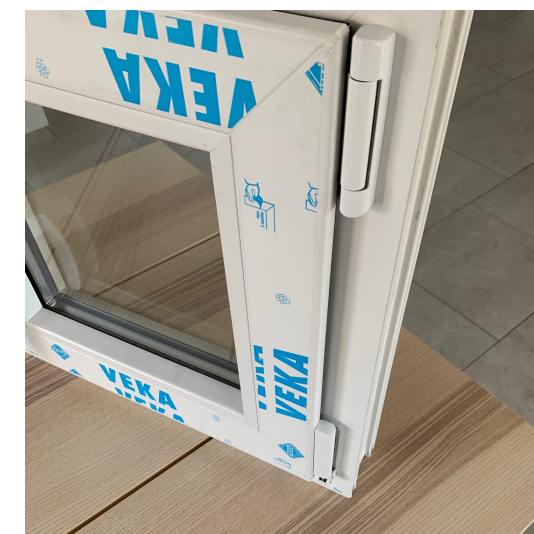
Adjustment screws, hidden under cap

Tip 2: If the sash is not level, find adjustment screws and adjust until sash is leveled. Upper screw: up and down adjustments; Lower screw: left and right adjustments.