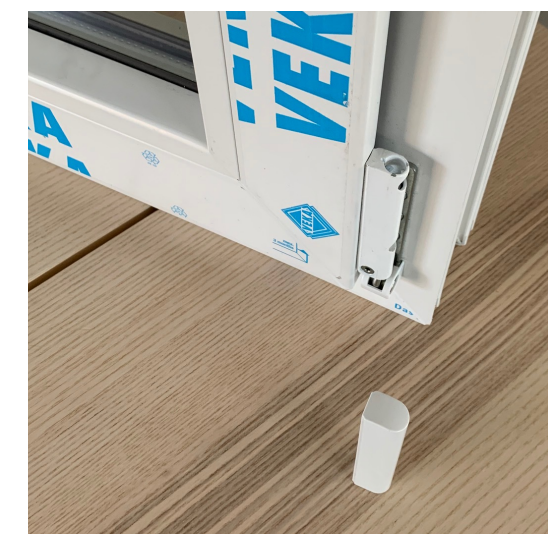
Adjustment screws, cap removed