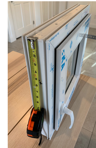
1st screw: 6" from top

Step 3: When window frame is properly placed and leveled, drill 3 screws per side through the window frame (1st and 3rd screw: 6" from the top and bottom, second screw in the middle).