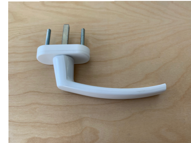
Handle, cap closed

Step 1: Install handle - move cap to the side and drive the two screws into the openings. Now you will be able to tilt or open the window.