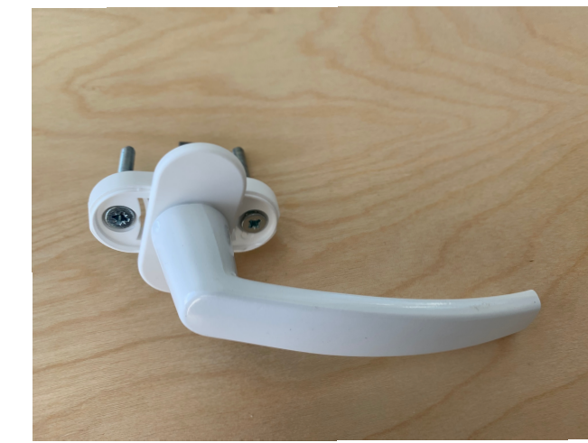
Handle, cap open

Tip 1: Take sash out of window frame, it is lighter and easier to install. Remove caps on the side and take out the pin from top. Lift and take out sash.